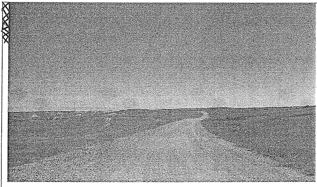
[Sichashunwe www.google picture]