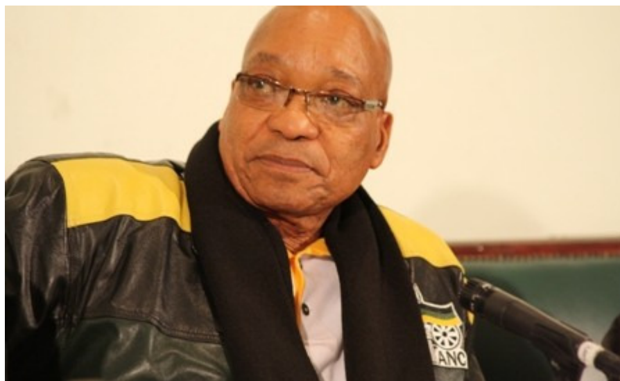
President Jacob Zuma