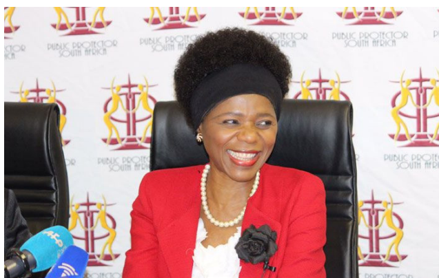
Public Protector Thuli Madonsela