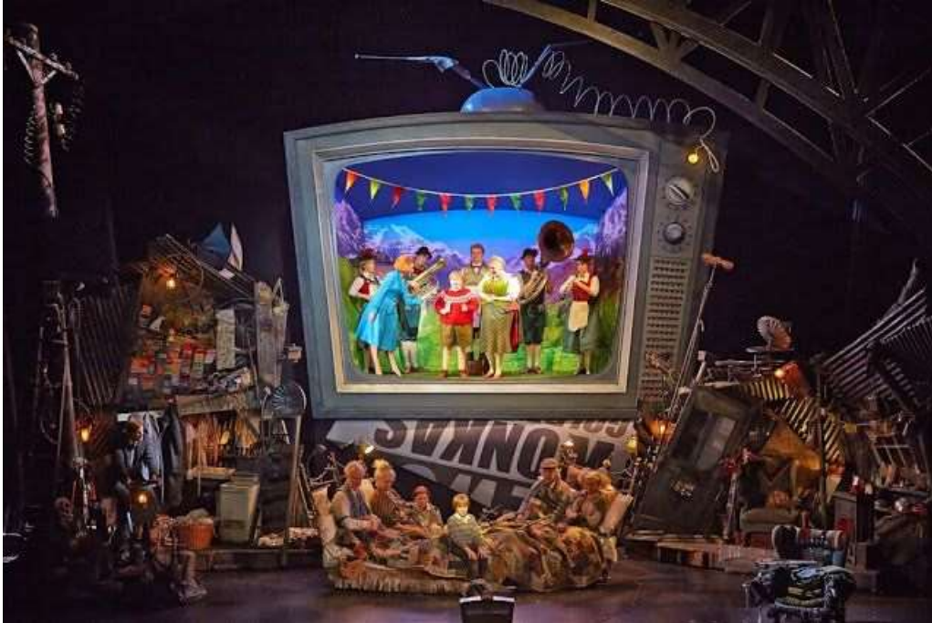
Charlie and the Chocolate Factory