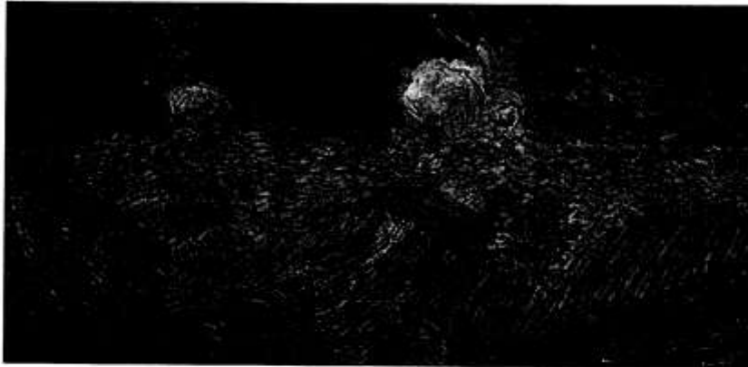
Fig. 6. Wheatfield with Crows. 1890