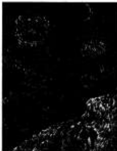
Fig. 1.2. Van Gogh, Country Road in Provence .