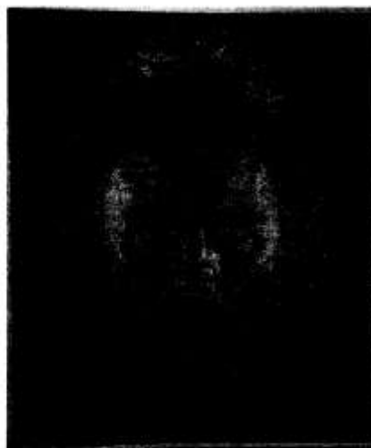
Fig. 5 Lucas 1986-87