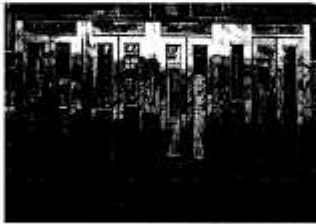
Fig. 1.1. Richard Estes, Telephone Booths . 1968