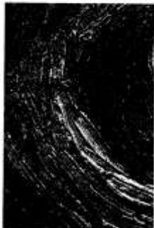
Fig. 7. Close up of the painting texture used in Fig. 6

12. Name the artist that painted Fig. 6 ?