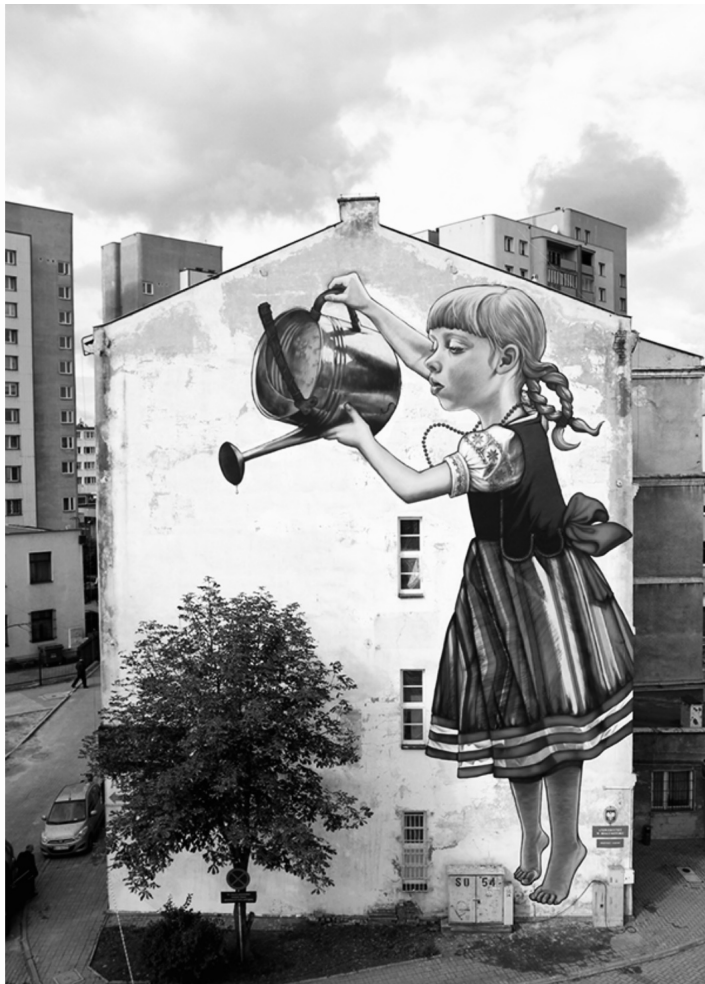
Figure 2. Natalia Rak. Mural. 2013. Girl with a watering can.

Refer to figure 2 to answer the following questions.