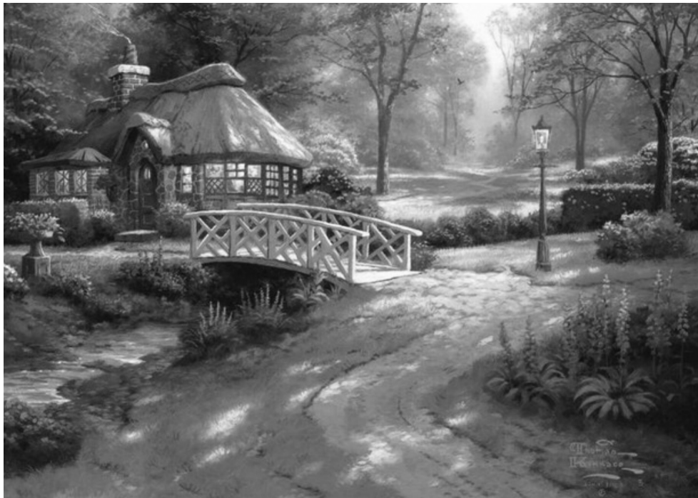
Figure 1. Thomas Kinkadee. Giclee print. Friendship cottage . Date unknown. Reference: painting.com

2.1. What two types of line has been used? Refer to part's of the work.