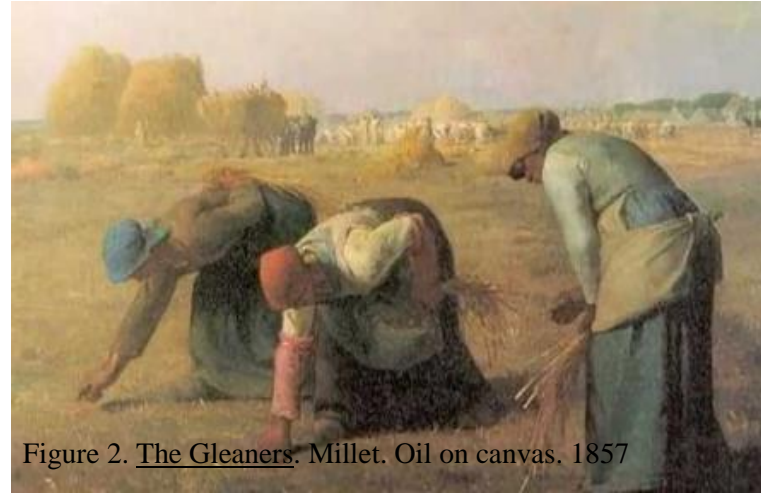
Figure 2. The Gleaners . Millet. Oil on canvas. 1857

1.1. Write a comparative essay between Figure 1 and Figure 2, The Gleaners , both paintings done by Millet. Use the following the guidelines below: