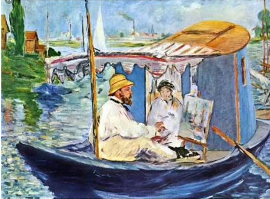
Figure 3. Monet Painting in his Studio Boat . 1874. Manet. Oil on canvas