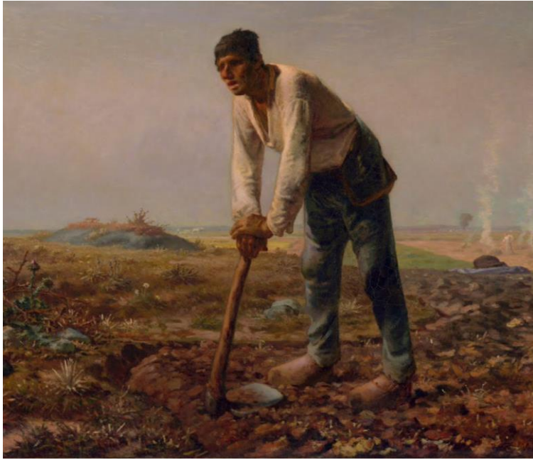
Figure 1. Man with a Hoe . Millet. Oil on canvas. 1862.