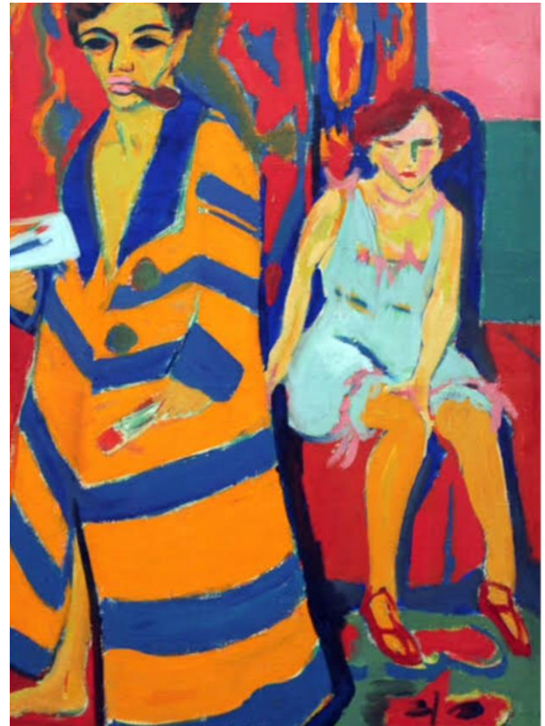
Figure 5. Kirchner. Self portrait with model. 1905. Oil on canvas.