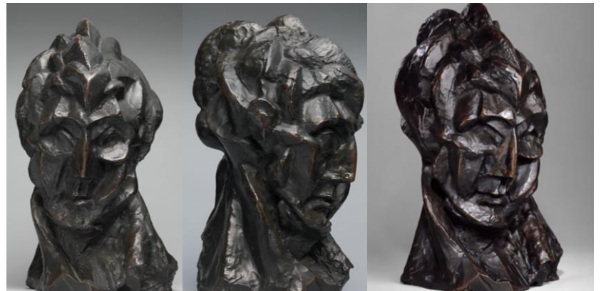
Figure 6. Picasso. Head of a women. 1906. Bronze.