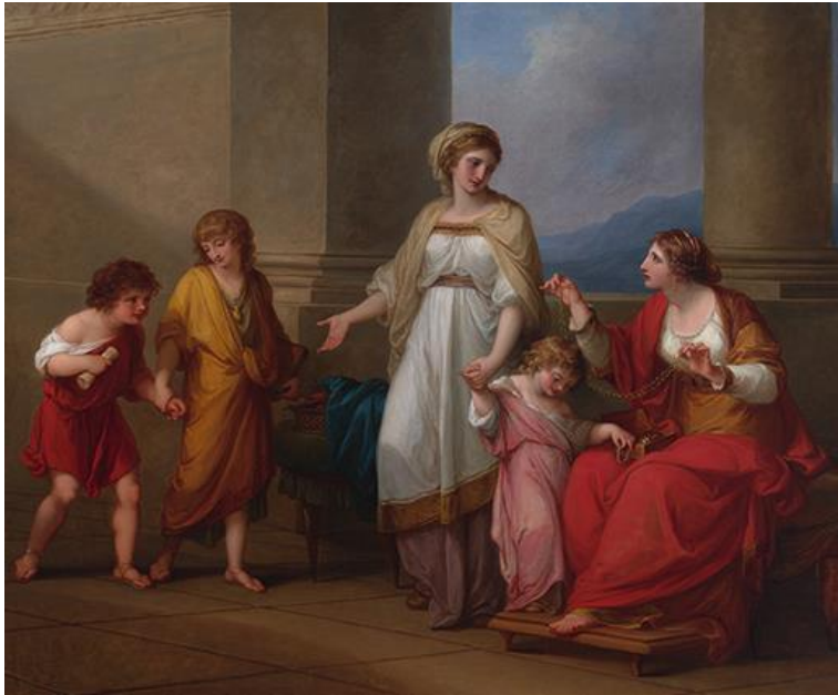
Figure 1. Angelica Kauffmann. Cornelia, Mother of the Gracchi, Pointing to her Children as Her Treasures. 1785. Oil on canvas.

Refer to Figure 1 above to answer the following question.