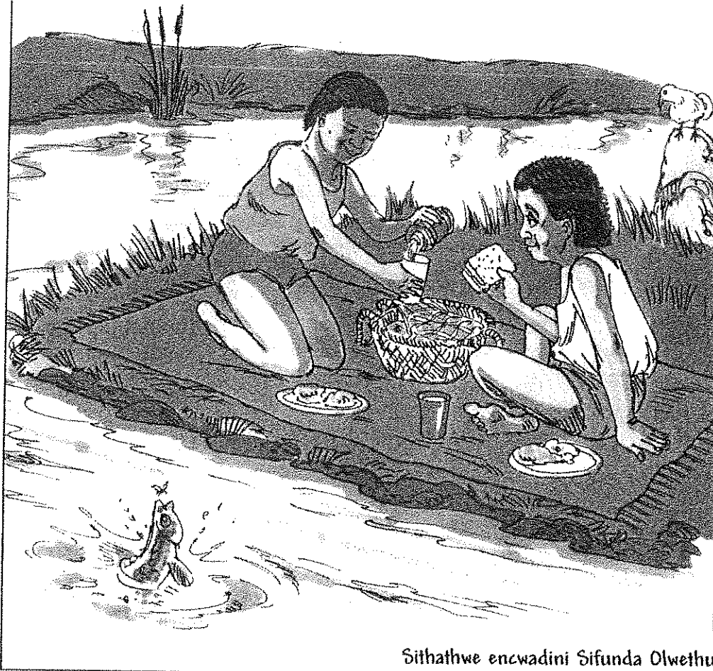
Sithathwe encwadini Sifunda Olwethunga Ibanga 4

Isibonelo: (i) Izingane zindlele umata zihleli ziyadla. (ii) wona.