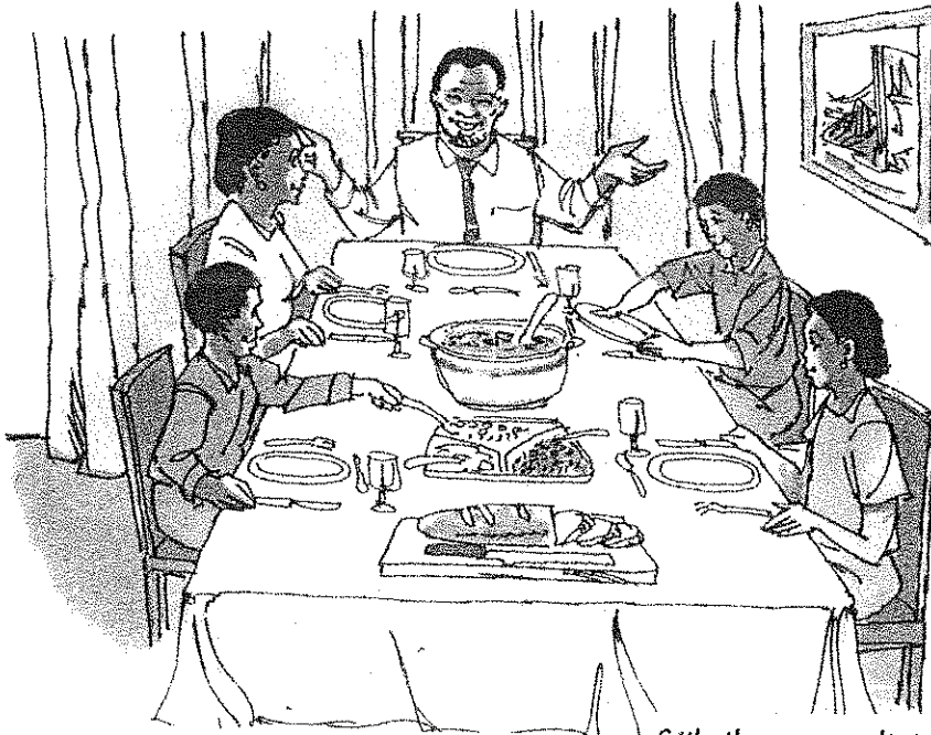
Sithathwe encwadini Sifunda Olwethunga Ibang 4