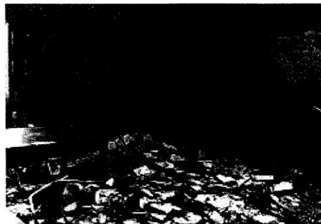
University of KwaZulu-Natal Law Library burnt down by students rioting during #feesmustfall protests