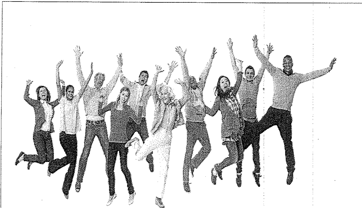
Sicashunwe ku- inthanethi