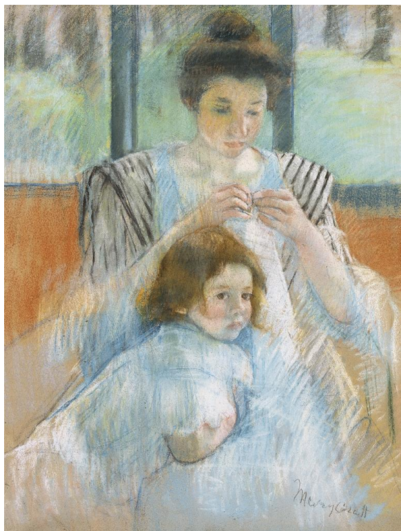
Image B: Mary Cassatt, Drawing Study of Young Mother Sewing . 1900. Pastel on paper.