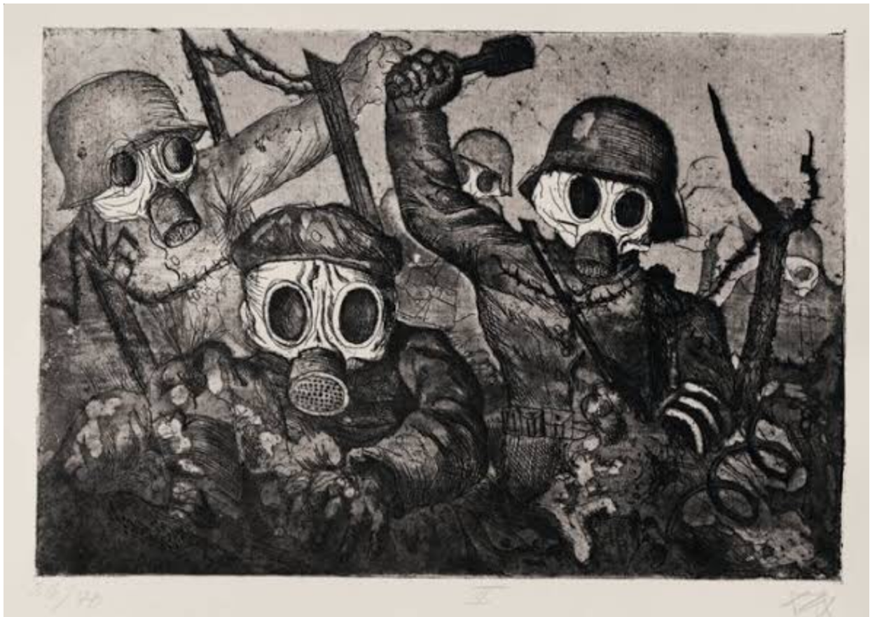
Figure 1. Otto Dix. Storm Troopers Advancing Under Gas . Etching. 1924.