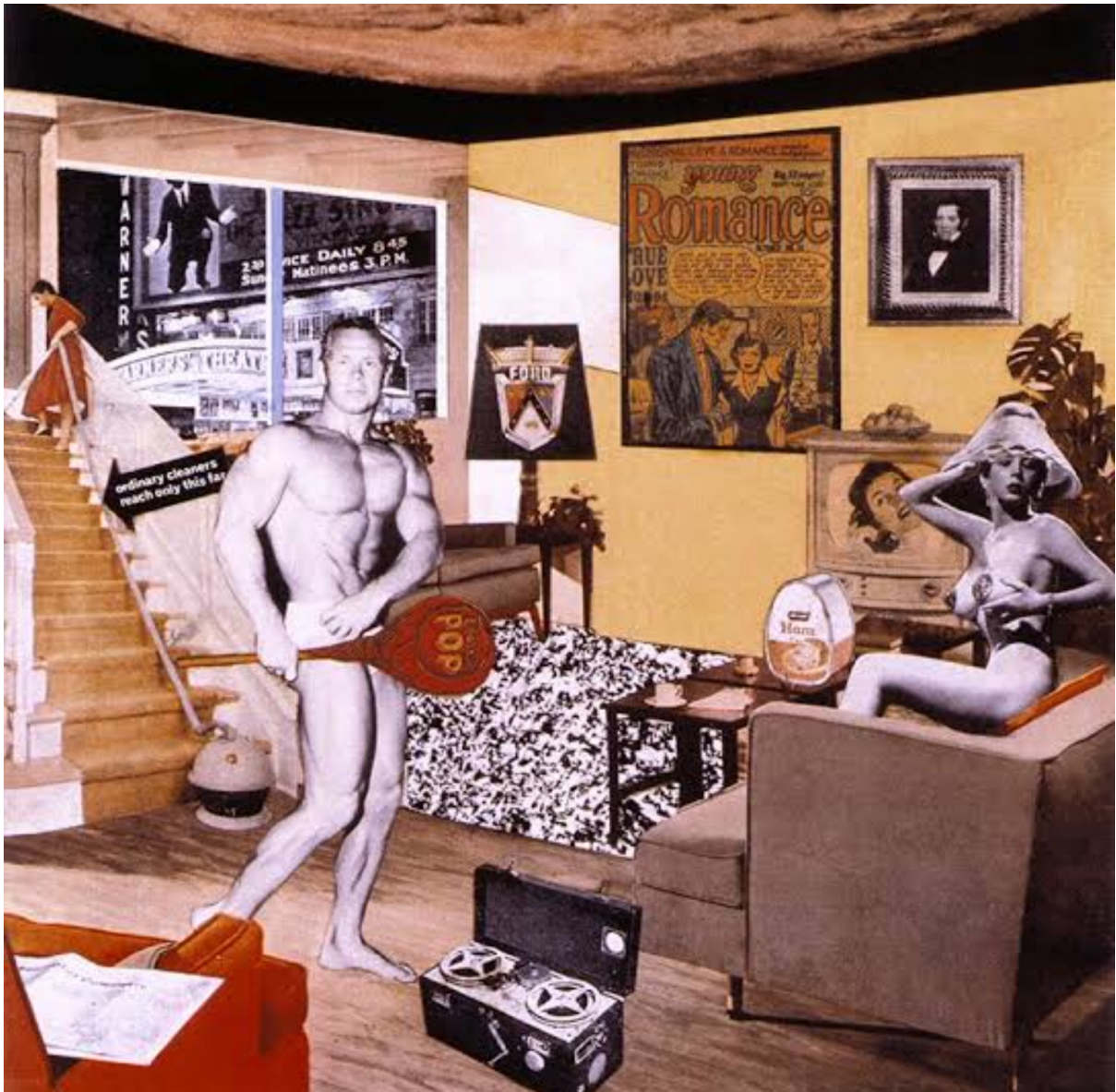
Figure 4. Richard Hamilton. Just What Is It That Makes Today's Home's So Different, So Appealing? 1956. Collage