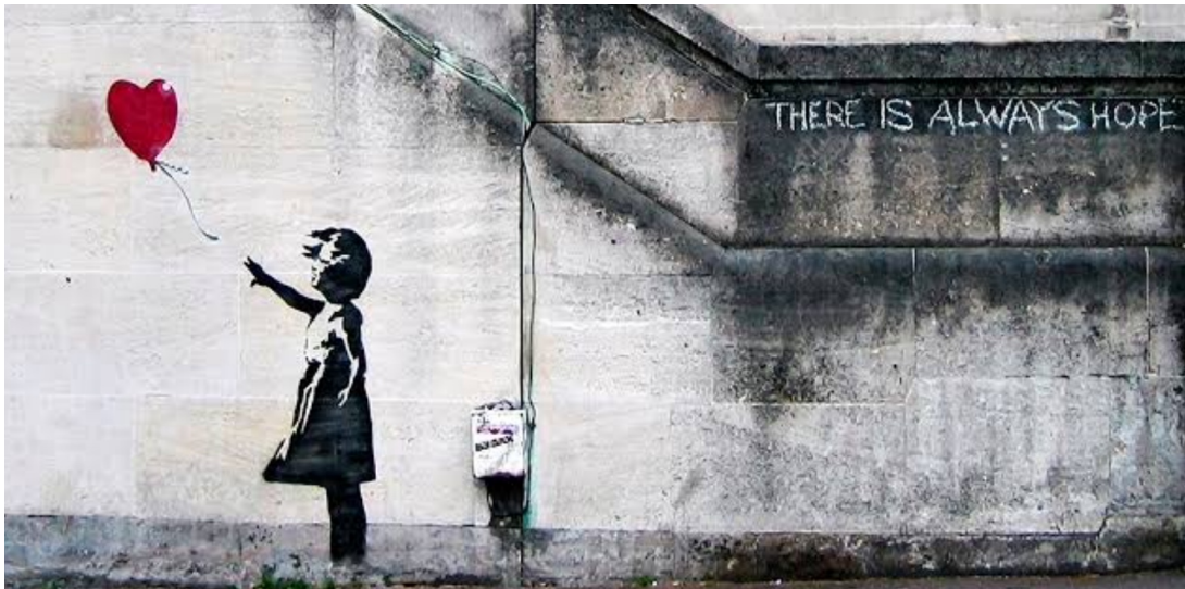
Figure 5. Banksy. Girl with Balloon . Mural. 2002

Balloon Girl (or Girl with Balloon ) is a 2002 mural by graffiti artist Banksy depicting a young girl letting go of a red heart-shaped balloon. Banksy has used a variant of this image in his 2014 campaign supporting Syrian refugees. A 2017 Samsung poll ranked Balloon Girl as the United Kingdom's number one favourite artwork.