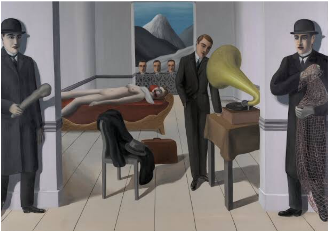
Figure 3. Rene Magritte. The Menaced Assassin . 1927. Oil on canvas.