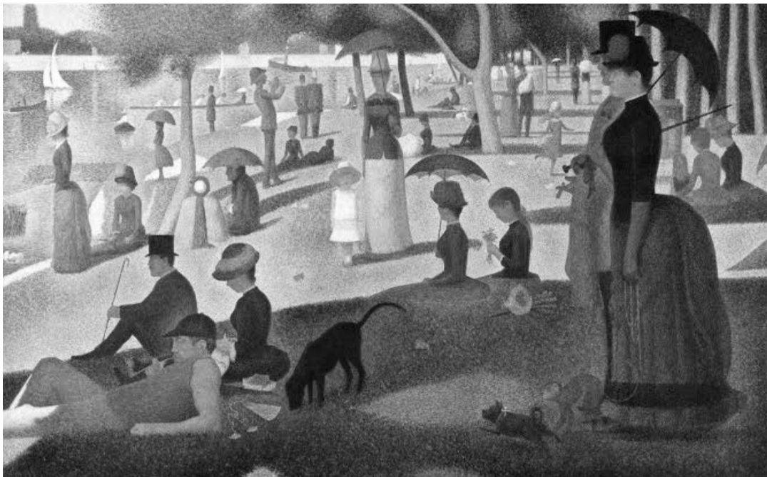
Figure 4. George Seurat. A Sunday Afternoon on the Island of La Grande Jatte . 1884-1886. Oil on canvas.

1.17. What is the title of the artwork in figure 4? (1)