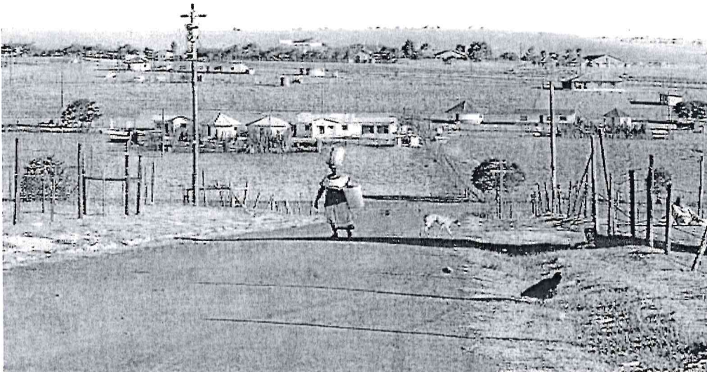
Eastern Cape

Examine the photograph of a rural settlement in the Eastern Cape and answer the questions that follow.