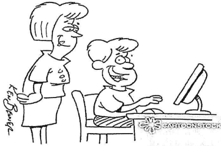
"Well, if God had a facebook page think of how many 'likes' he'd have!"

Look at the following images and answer the questions below.