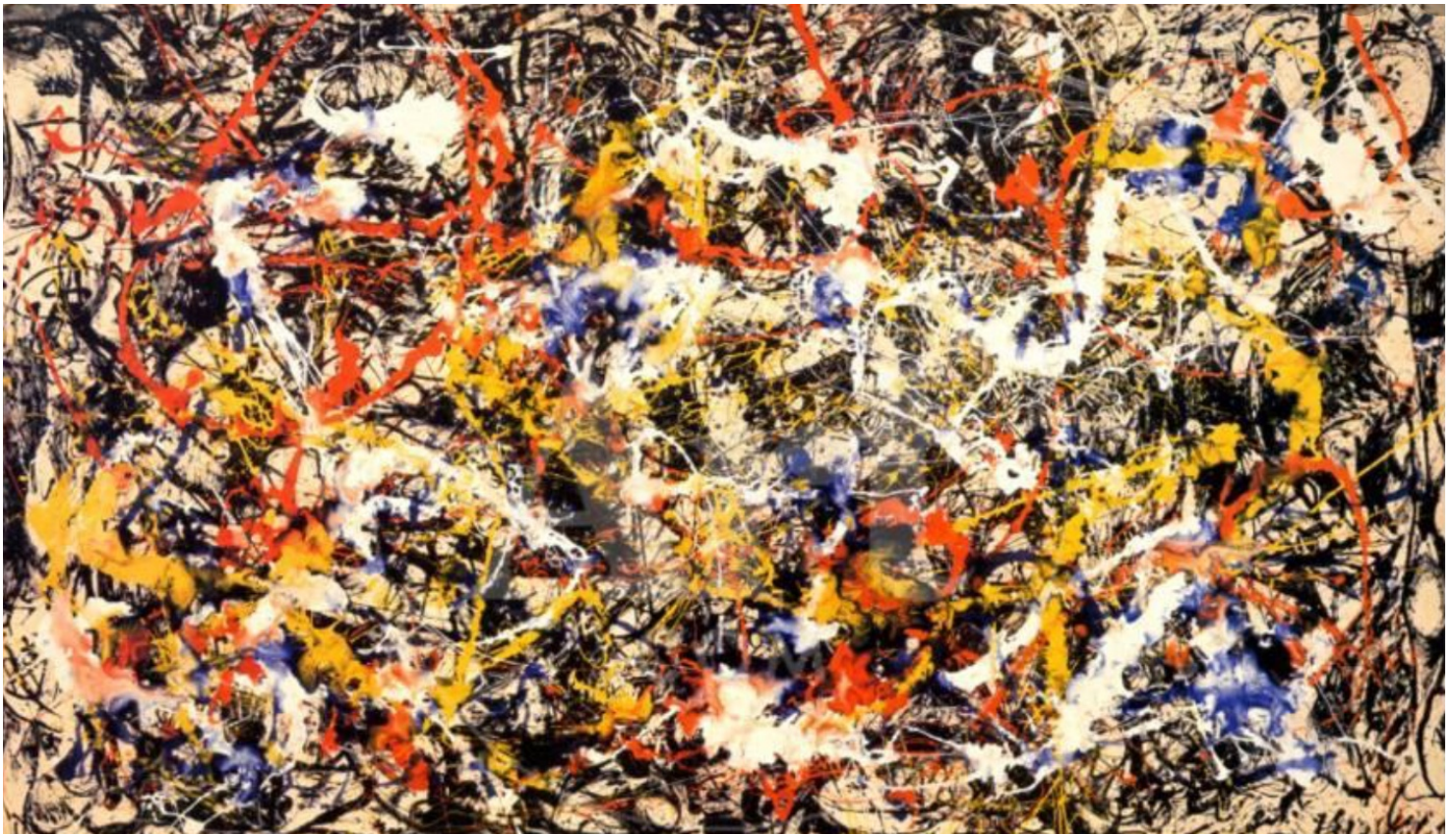
Figure 2. Jackson Pollock. Convergence . 1952. Oil on canvas.