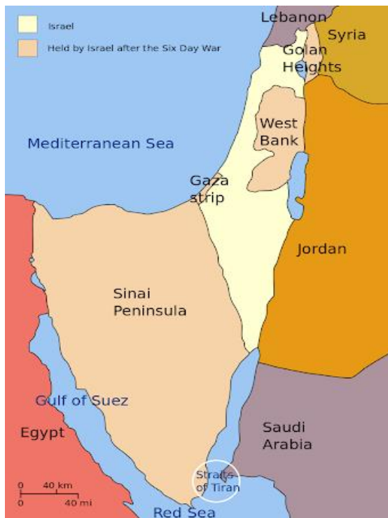
Sinai, Gaza Strip, West Bank, Jerusalem and Golan Heights.

SOURCE 6B: This map indicates the vast Arab territories that were occupied by Israel during the 1967 war.