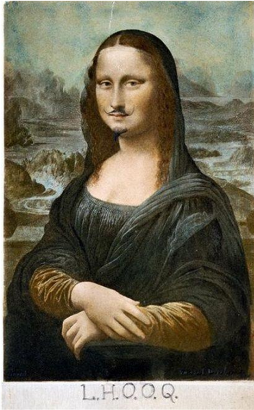
Figure 4. Marcel Duchamp, LHOQQ , 1919

Duchamp transformed a cheap postcard of the Mona Lisa (1517) painting, which had only recently been returned to the Louvre after it was stolen in 1911. While it was already a well-known work of art, the publicity from the theft ensured that it became one of the most revered and famous works of art. On the postcard, Duchamp drew a moustache and a goatee onto Mona Lisa's face and labelled it L.H.O.O.Q.