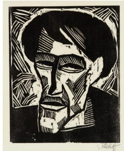
Figure 2, Karl Schmidt-Rottluff, Otto Mueller , Woodcut, 1914

1.1 Look at the artworks, in Figure 1 and Figure 2, above and write a short essay on why you think they belong to German Expressionism. Discuss the following in your essay: