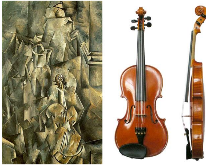
Figure 3, Left: Georges Braque, Pitcher and Violin , 1909–10, oil on canvas ; Right: a violin seen from the front and the side

2.1 Look at Figure 3, write a short essay in which you discuss the following: