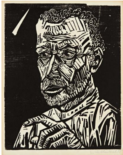
Figure 1, Erich Heckel, A disciple , Woodcut, 1915