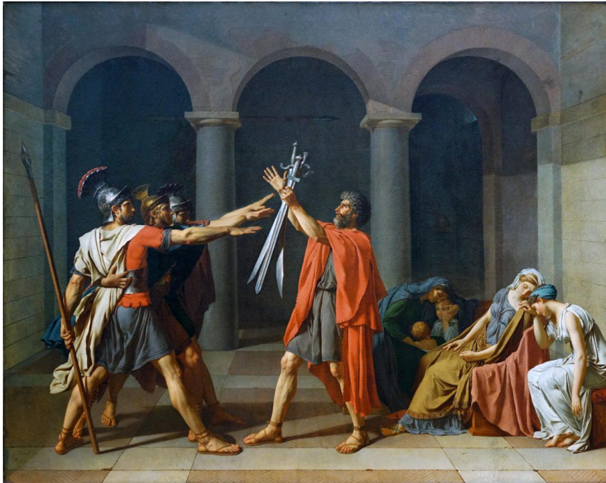
Figure 2, Jacques-Louis David, Oath of the Horatii , 1784, oil on canvas

Look at the artwork below, Figure 2, to answer the following questions: