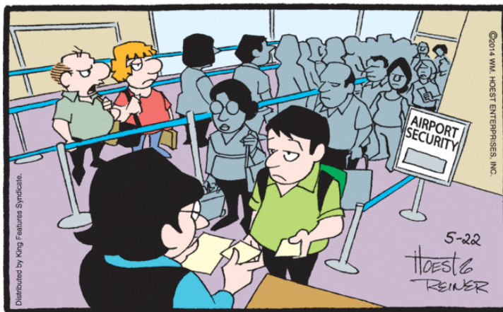
"IF THE WRIGHT BROTHERS HAD KNOWN WHAT THEY'D STARTED, THEY WOULD HAVE STUCK TO FIXING BICYCLES."

https://comicskingdom.com/trending/blog/2014/11/25/tuesday-s-top-ten-comics-holiday-travel