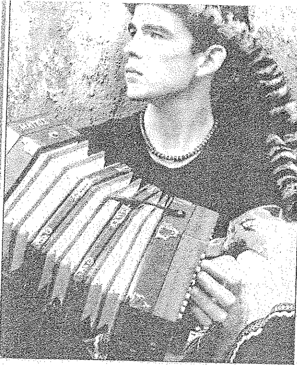
UMCULI kamaskandi uQadasi ozobhulela uJohnny Clegg amazolo ekhonsathini i-Old Mutual at the Lake ezobe i-eBotanical Gardens namuhla