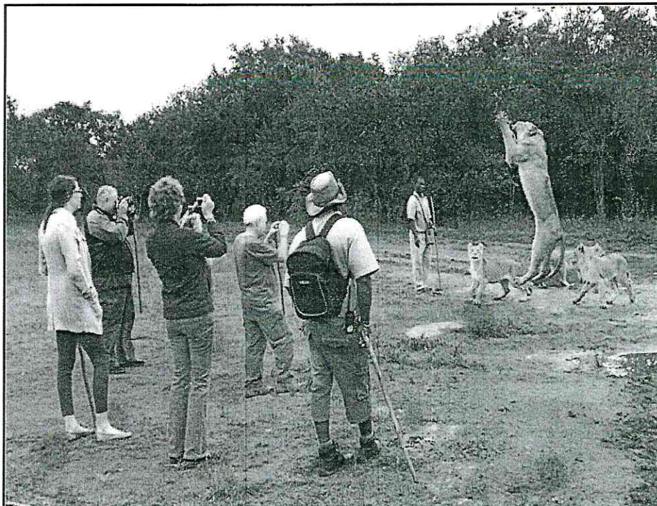
[Sicashunwe ku- www.googlepics.com ] [50]