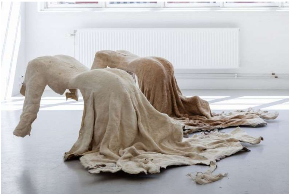
FIGURE 6b: Nandipha Mntambo UMFANEKISO WESIBUKO (MIRROR IMAGE) 2013, Cow hide, resin