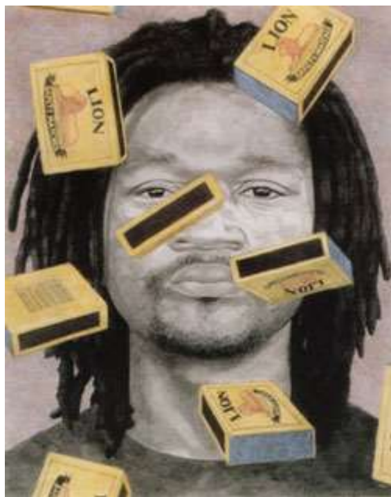
FIGURE 2b: Richard Smith. RICHIE WITH LIONS , mixed media on paper, 155cm x 125 cm.