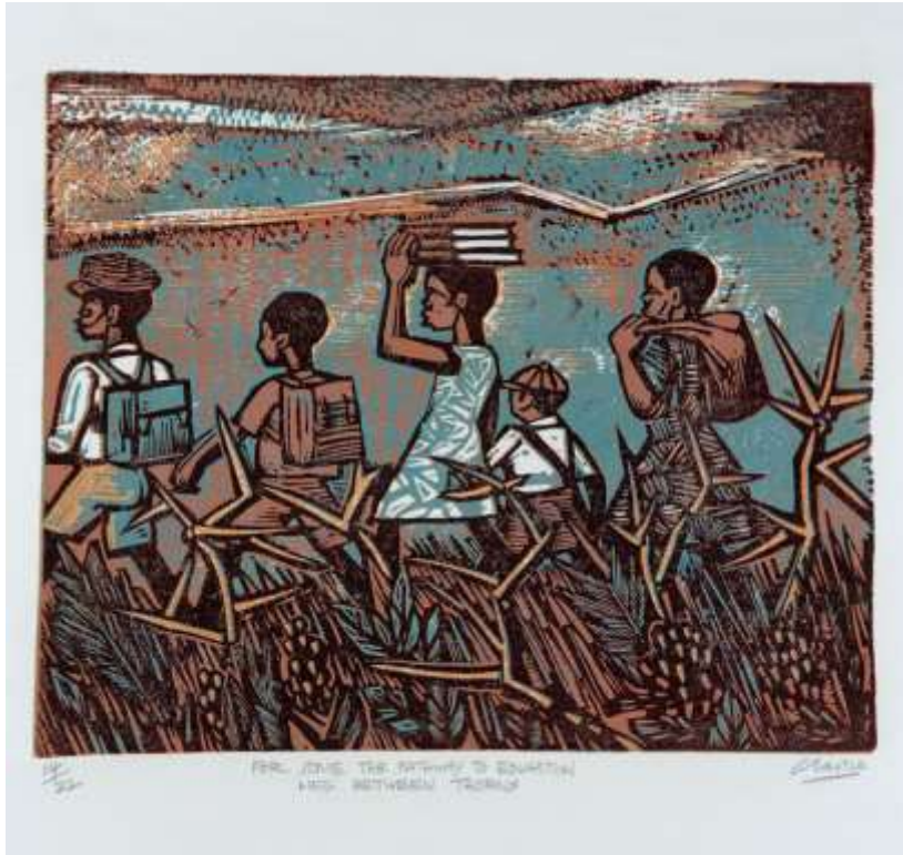
FIGURE 1a: Peter Clarke. FOR SOME THE PATHWAY TO EDUCATION LIES BETWEEN THE THORNS , coloured linocut, 1993.