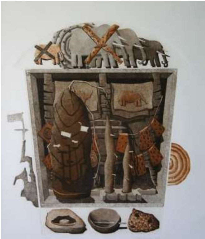
FIGURE 2a: Pippa Skotnes FOR /KWEITEN TA// KEN , coloured etching on paper, 1993.