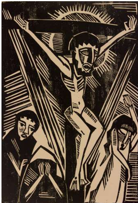
FIGURE 4b: Karl Schmidt- Rottluff. CRUCIFIXION , Woodcut on paper, 1918.