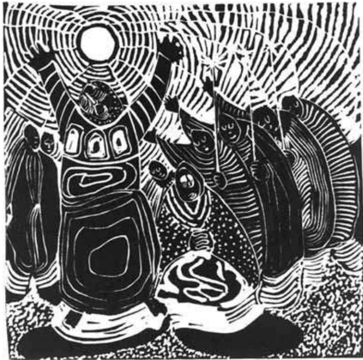
FIGURE 4a: Dan Rakgoathe. MYSTICAL AWAKENING , 1971, Linocut on paper.