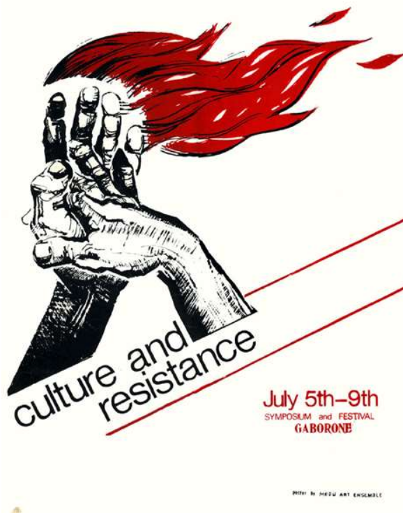
FIGURE 3b: Medu Art Ensemble, CULTURAL RESISTANCE POSTER , late 1970's – early 1980's