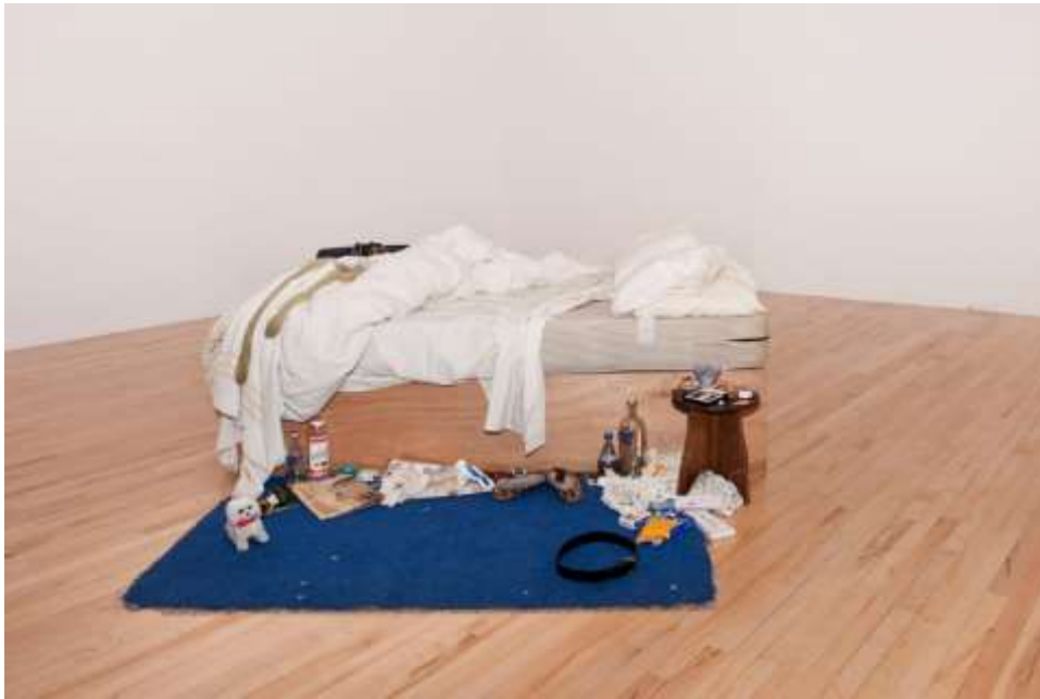
FIGURE 5 above and details below: Tracy Emin THE BED , 1998. Bed, linen, empty alcohol bottles and various other everyday found objects.