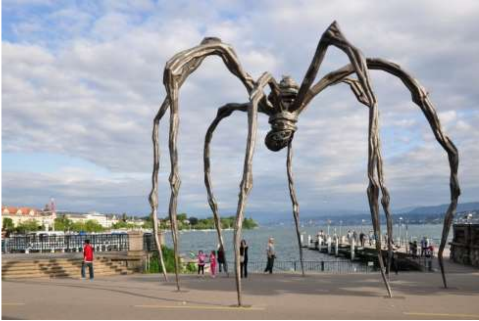
FIGURE 6a: Louise Bourgeois MAMAN (Mother). 1999. Bronze. 30 Feet tall.